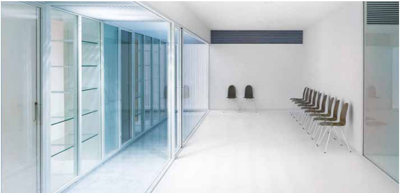
The Tongue chairs MEDICAL CENTER ZARAGOZA Zaragoza, Spain